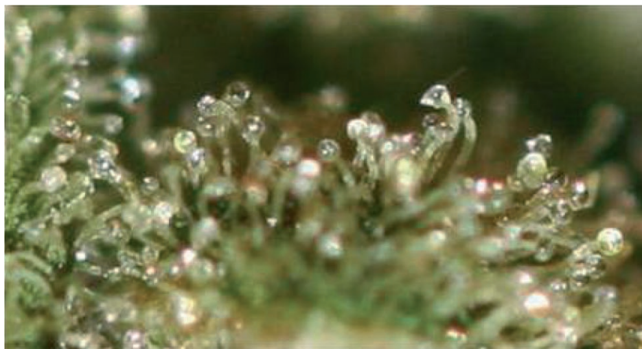
Fig. 3. Cannabis glandular trichomes in vivo

complicate the picture, certain cannabis strains are capable of utilizing a different precursor than olivetol, namely 4-carboxy-5-propylresorcinol ( Raphael Mechoulam , personal communication, 2005), to form the propyl phytocannabinoids: cannabigivarin (CBGV), tetrahydrocannabivarin (THCV), cannabidivarin (CBDV), and cannabichromivarin (CBCV) after decarboxylation. Lest anyone think this fact a bit of biochemical irrelevancy, these previously little studied variants may be of considerable pharmaceutical importance, as THCV was recently demonstrated to be a potent antagonist at cannabinoid receptors CB 1 and CB 2 [39]. The maturation of Mendelian genetic techniques has produced a modern revolution in the potential for creative medical cannabis phytochemistry that may be applied to various biochemical targets.