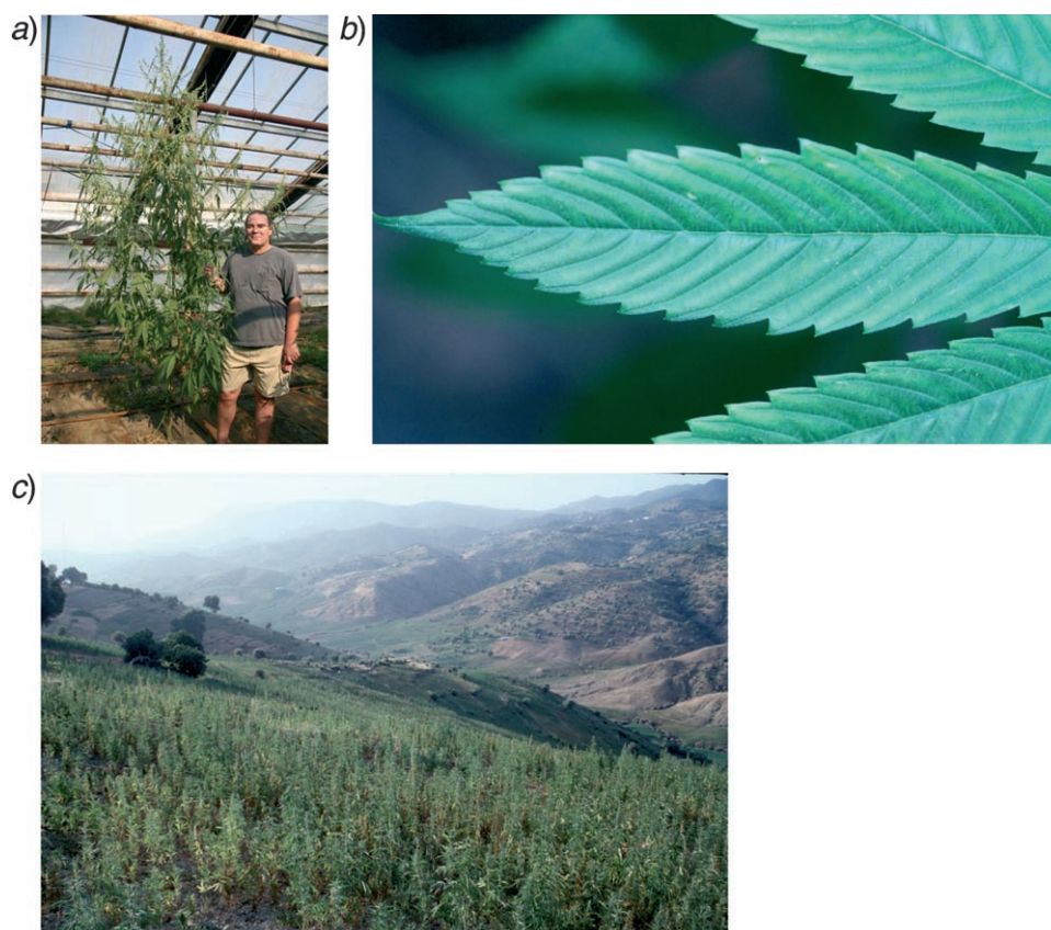
Fig. 2. Plant examples. a) Sativa type form, but indica genetics ( E. B. R. , HortaPharm BV ); b) indica type, broadleaf ( E. B. R. , HortaPharm BV ); c) ruderalis -type form, Rif Mountains, Morocco.

Hillig and Mahlberg conducted a chemotaxonomic study of the same set of accessions examined in the genetic analysis. Cannabinoid content was determined by gas chromatography (GC) and starch-gel electrophoresis [35]. The results supported a two-species concept ( C. sativa and C. indica ) and led to other interesting observations. To digress momentarily, phytocannabinoids are produced in cannabis by glandular trichomes (Fig. 3, trichomes) as carboxylic acids from geranyl pyrophosphate and olivetol precursors to yield the parent phytocannabinoid compound, cannabigerolic acid (CBGA). This cannabinoid accumulates in a newly discovered plants harboring a metabolic dead-end at this molecule (genotype homozygous for allele B_o ) [36]. In drug strains, in contrast, the enzyme tetrahydrocannabinolic acid synthase (recently crystallized by Shoyama et al. ) [37] catalyzes the conversion of CBGA to THCA (the precursor of THC, which forms by decarboxylation of THCA under heat or storage) with highest yields in plants homozygous for the co-dominant B_T allele. Other strains produce an abundance of cannabidiol (CBD) via the B_D allele (also co-dominant), or cannabichromene (CBC) via the recessive B_C allele [38]. To further