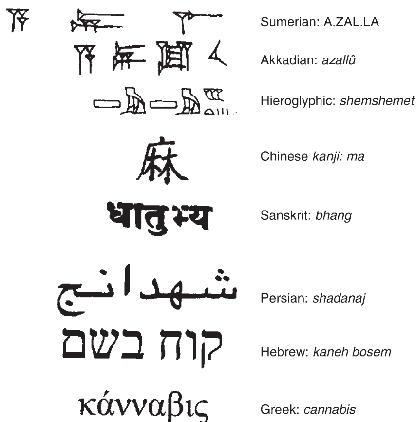
Fig. 5. Cannabis in various ancient languages

The antibacterial effects of honey are well-known, but less attention has been paid of late to the antibiotic effects of cannabis and its components [86], antihelminthic activity prominently described in the later Arabic literature [87], or insecticidal potential [4][14]. These reported vermifugal properties of cannabis thus may have predated Galen's reports [88][89] by 1700 years!