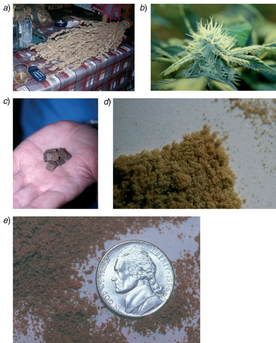
Fig. 4. Cannabis forms. a) Bhang , or unmanicured herbal cannabis, Rif Mountains, Morocco; b) ganja or sinsemilla , (photo E. B. R., Hash, Marihuana and Hemp Museum, Amsterdam); c) charas , or hashish , 'soapbar' from Morocco, as encountered in the UK; d) sifted hashish, Amsterdam; e) water hash, Amsterdam.

5. History of Medicinal Cannabis. – 5.1. Egypt . Egypt is universally recognized as one of the great early civilizations, with an advanced medical system. In prior generations, most authorities have claimed an absence of definitive evidence of