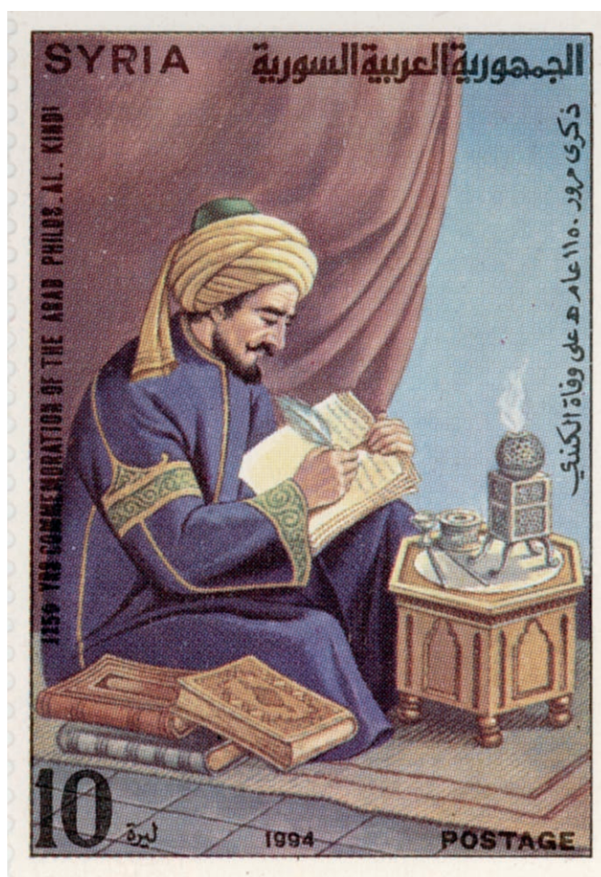
Fig. 9. Syrian postage stamp commemorating al-Kindi, employer of cannabis as a muscle relaxant

Spasticity in multiple sclerosis and other diseases remains a difficult treatment challenge. It was recently demonstrated that spasticity in affected animals is under tonic control of the endocannabinoid system: CB 1 agonists including THC ameliorate