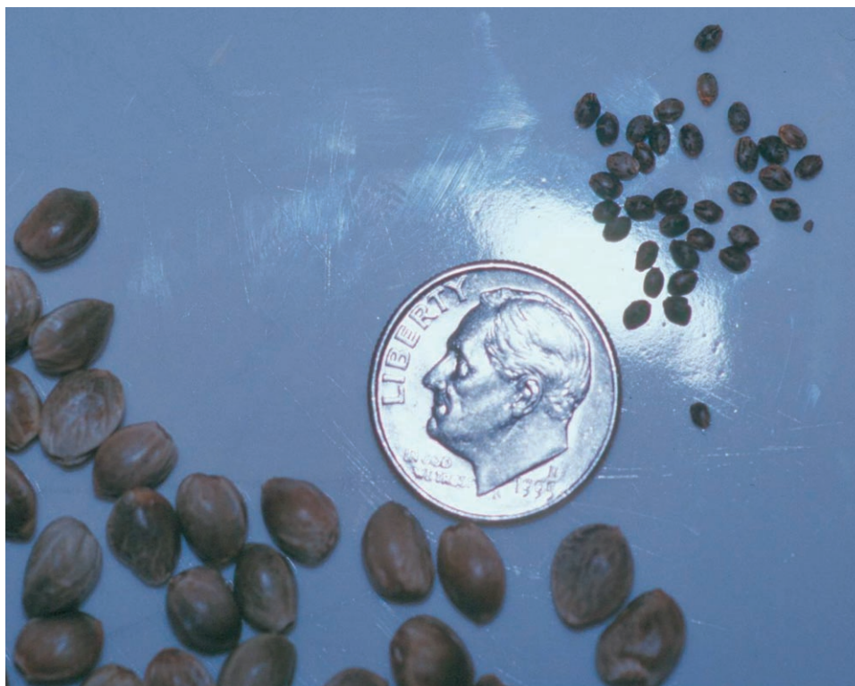
Fig. 1. Seed-size variation in cannabis . Seeds at right are a feral plant in Kashmir (800 seeds/g) and those at left are culinary seeds from China (15 seeds/g) (see text for details; photo E. B. R., from collection of David Watson, HortaPharm BV, Amsterdam).

Phytocannabinoids [2] are unique to cannabis, and number some 66-odd molecules [3]. Tetrahydrocannabinol (THC) is the predominant psychoactive cannabinoid, and has partial agonist activity at cannabinoid receptors CB_1 and CB_2 . Its metabolic breakdown product, cannabinalol (CBN), also has modest psychoactive effects, while other representatives have their own unique attributes (reviewed in [4]). Whereas cannabinoid-like structures have been reported from the New Zealand liverwort, Radula marginata [5], no actual biochemical activity at cannabinoid receptors has been reported to date. Recently, modulation of tissue necrosis factor alpha (TNF- \alpha ) in Echinacea spp. extracts was demonstrated to occur via CB_2 receptors [6].